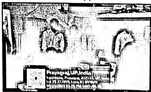
Campaigning for women education and empowerment

Professor & Head Department of Geography University of Allahabad Prayagraj-211002