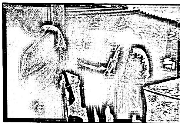
Discussion on women empowerment through innovative community practices