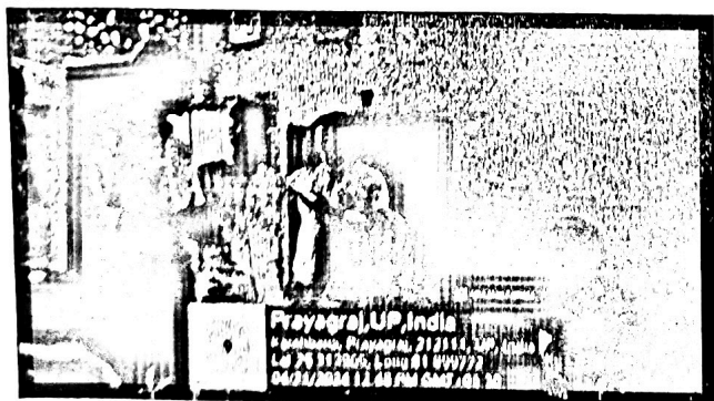
Demonstration of Government Schemes for rural education